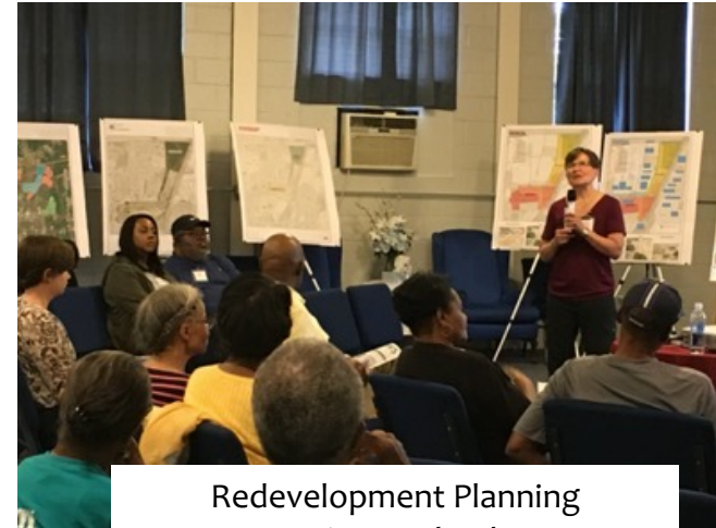
Redevelopment Planning Meeting - Columbus