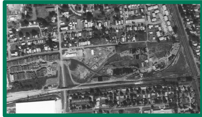
Former Tronox Wood Treating Facility, Bossier City, LA (1982)