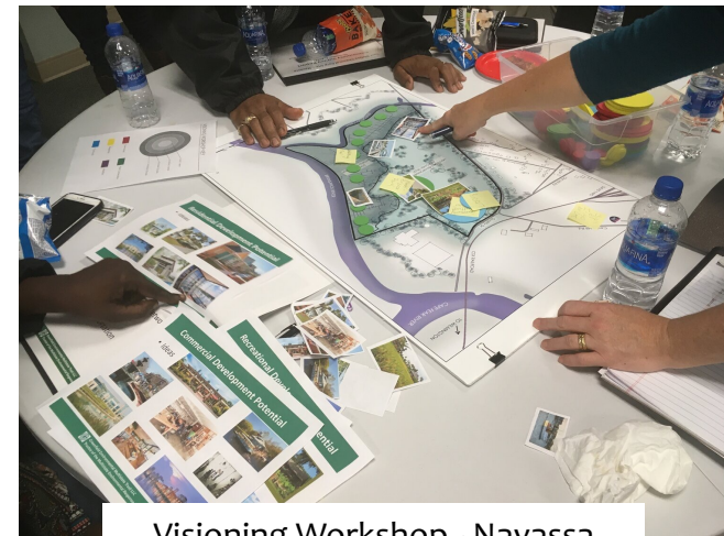
Visioning Workshop - Navassa