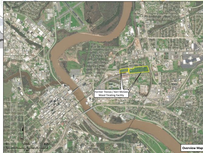
Former Tronox/Kerr-McGee Wood Treating Facility Bossier City, Louisiana