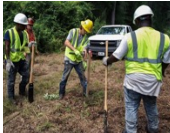
Local Contractors and Contractor Training in Columbus