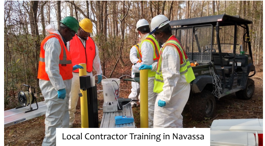
Local Contractor Training in Navassa