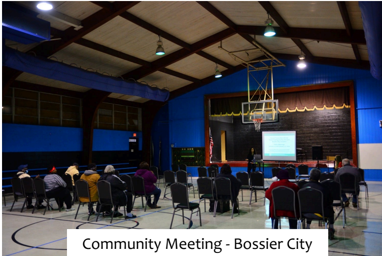
Community Meeting - Bossier City