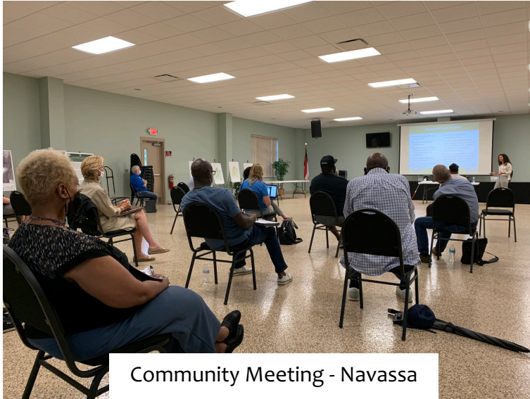
Community Meeting - Navassa